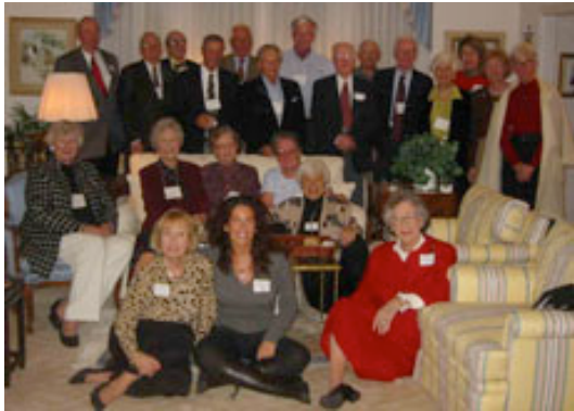
With all the board members of the Brunswick Community Concerts Association