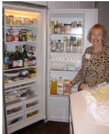
The fridge after the party... Imagine how it was before!!!